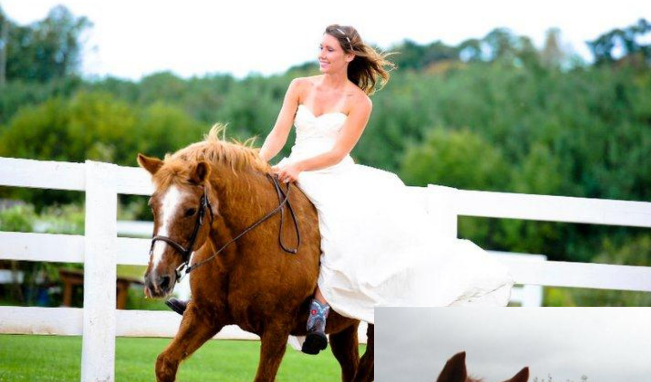
Me with my red-headed mares and their friend